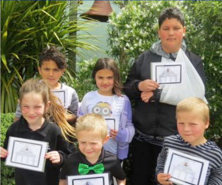
Room 6 have been writing some “Bio Poems”...